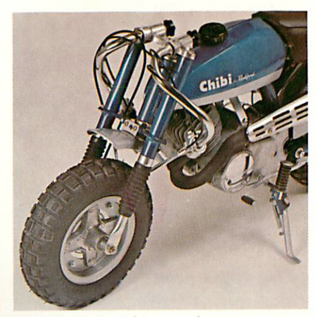
Chibi is designed to go wherever you go, easily and safely, in the trunk of your car. Handlebars fold at the twist of a knob, fuel system seals closed.