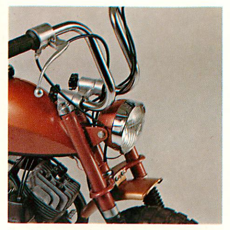
Headlight and taillight are standard equipment on the new Chibi. Handlebars fold for easy transporting in auto trunk.