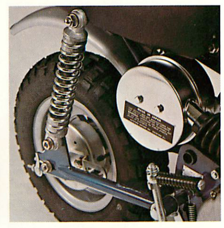
When you own a Chibi, you'll want to raise a little dust. Chibi's oversized air cleaner is designed to keep it out of the engine. Element is replaceable.