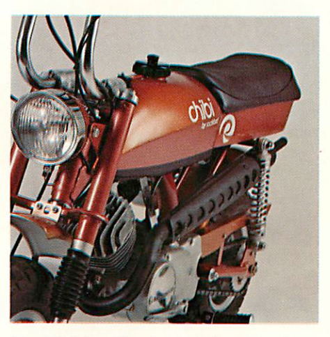
New Chibi styling is highlighted by cleanly flowing tank lines. Saddle base encloses roomy storage compartment.