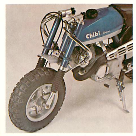
Chibi is designed to go wherever you go, easily and safely, in the trunk of your car. Handlebars fold at the twist of a knob, fuel system seals closed.