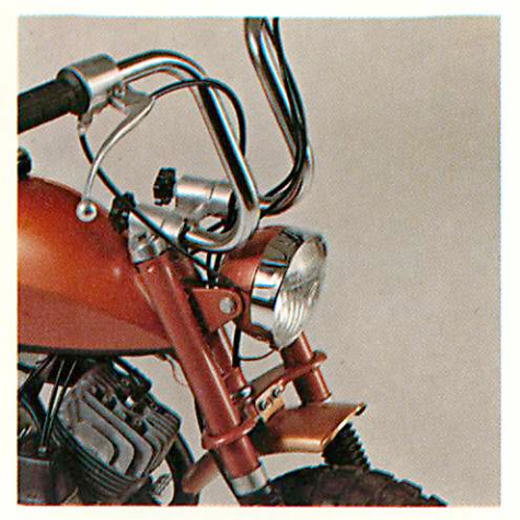
Headlight and taillight are standard equipment on the new Chibi. Handlebars fold for easy transporting in auto trunk.