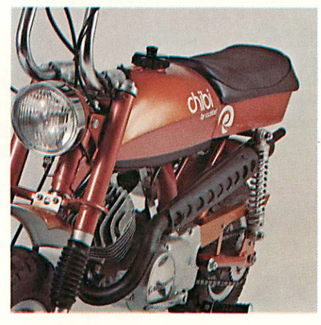
New Chibi styling is highlighted by cleanly flowing tank lines. Saddle base encloses roomy storage compartment.