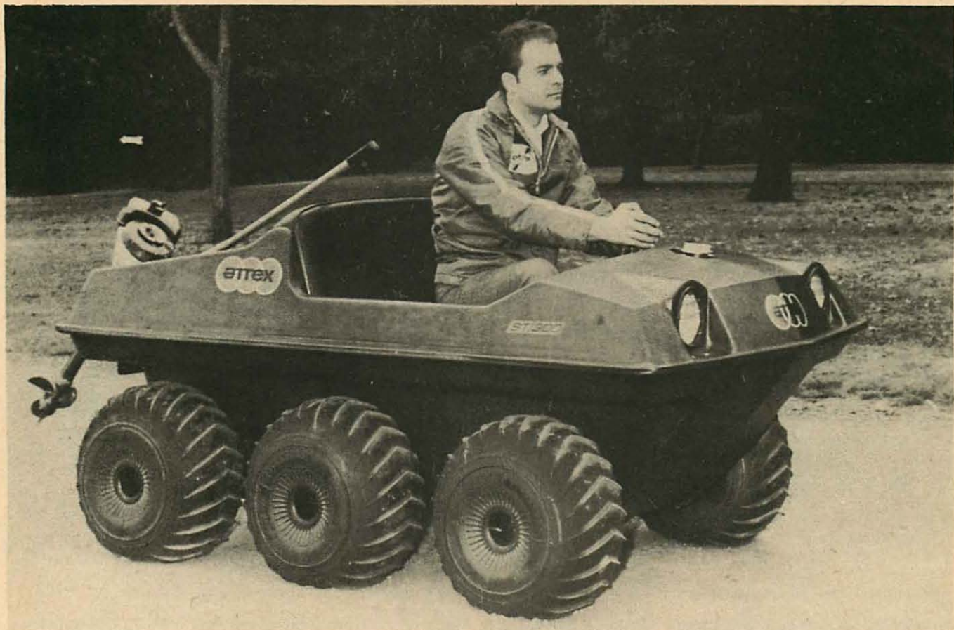
Special ST/300 features an outboard motor for increased water speeds and duck blind paint treatment. It's for hard-core hunters.

body. The design results in a solid and watertight front and bottom section.