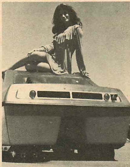
The shape of things to come! Highly-styled body is of impact-resistant construction.

Stylewise, the Dual Tracker comes off more like a total vehicle than just a skimpy fiberglass-bodied chassis. The fastback styling, dual cockpit seating and console controls give the