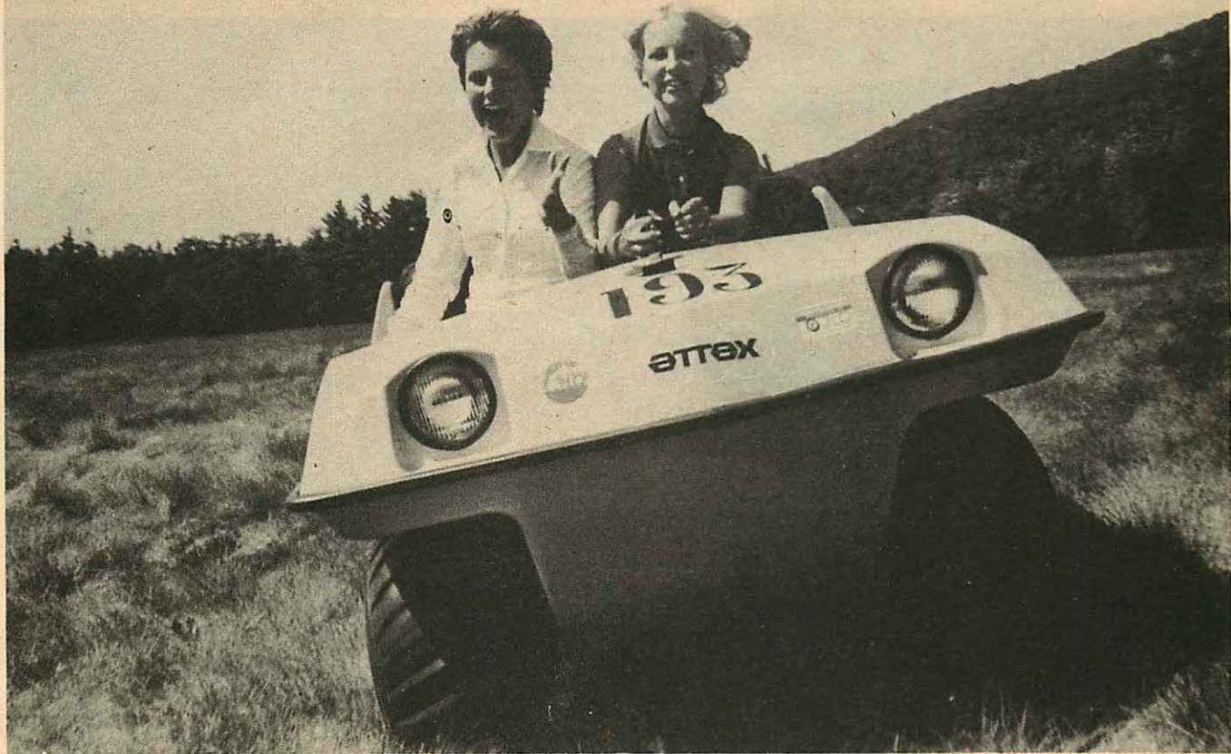
Cheapest, stock Plain Jane model offers just as much fun motoring as more expensive and powerful job. Control is via twin-stick setup.