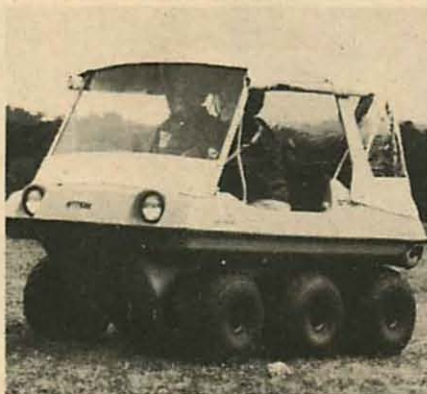
Gee dad, roll up windows and a windshield!

Optional equipment includes a six-wheel extension kit which enables owners to install three additional wheels on each side of the vehicle, making 12 in all, for greater traction and maneuverability, particularly on the water or in the snow. Windscreens and convertible fabric tops are available for all-season additional comfort. Other equipment includes a transport trailer with tilt-bed, rally-