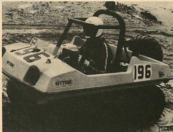
Neat kit converts Attex to 12-wheel-drive for banzai go-everywhere wailing. Specially-prepared Attex made the Mexican 1000 (Baja) scene.