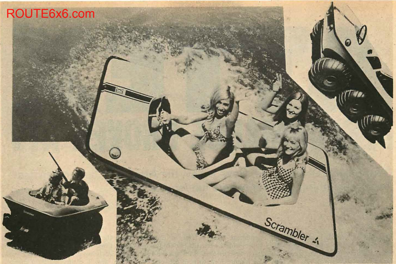
This composite photo speaks for itself. The "Scrambler" is a fun and functional machine with unlimited potential on land and waterways. The "Scrambler" is an extremely durable machine which requires a minimum of maintenance. Top line Marc XII has a 12-hp engine.