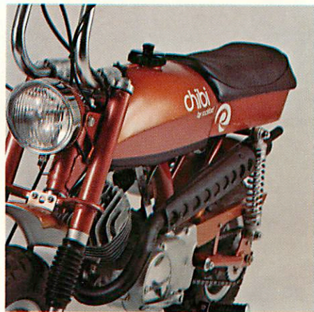
New Chibi styling is highlighted by cleanly flowing tank lines. Saddle base encloses roomy storage compartment.

New lighting system, all new styling, traditional Bridgestone performance – that's CHIBI. Chibi's acceleration and climbing ability have to be experienced to be believed. The 5.8 hp engine and 3-speed transmission can get you places ordinary mini-bikes can't. The folding handlebars and fuel shut-off system make transporting a breeze, too. Test ride a Chibi and get ready to change your mind about what a mini-cycle should be.